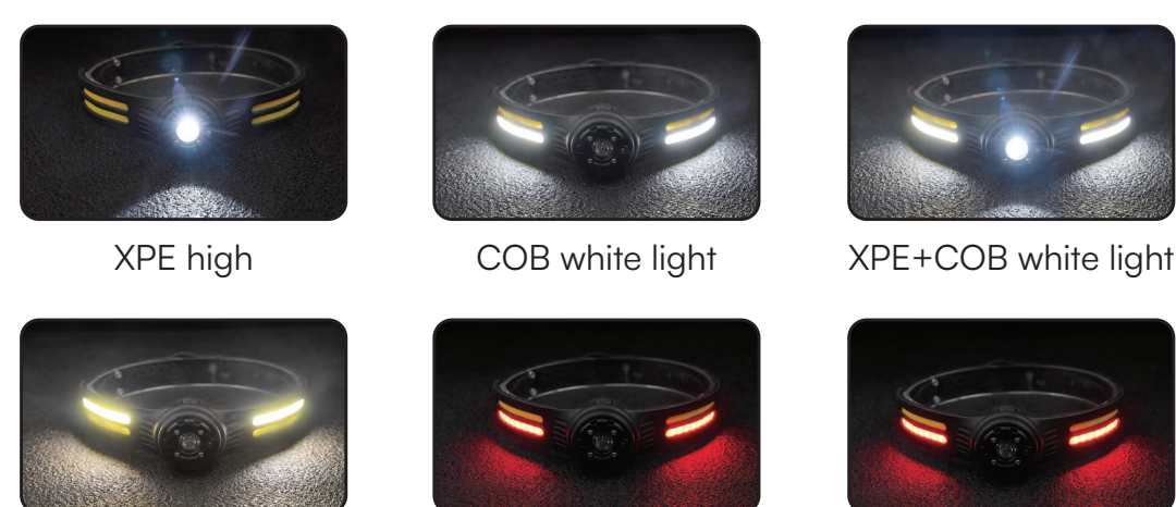
COB warm light

long press the switch to turn on/off sensing, all gears can be sensed